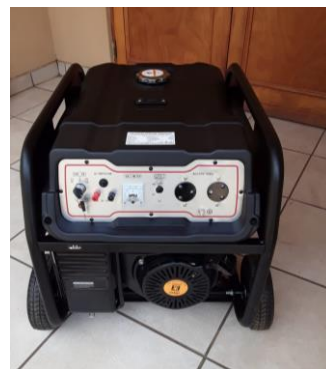
Generator From "Friends for Africa" (NL)

Our Preschool was also blessed with a generous financial donation from the Regions Beyond Covid-Relief Fund.