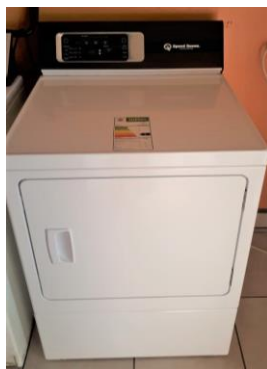
Tumble dryer From Umfolozi Sugar Mill